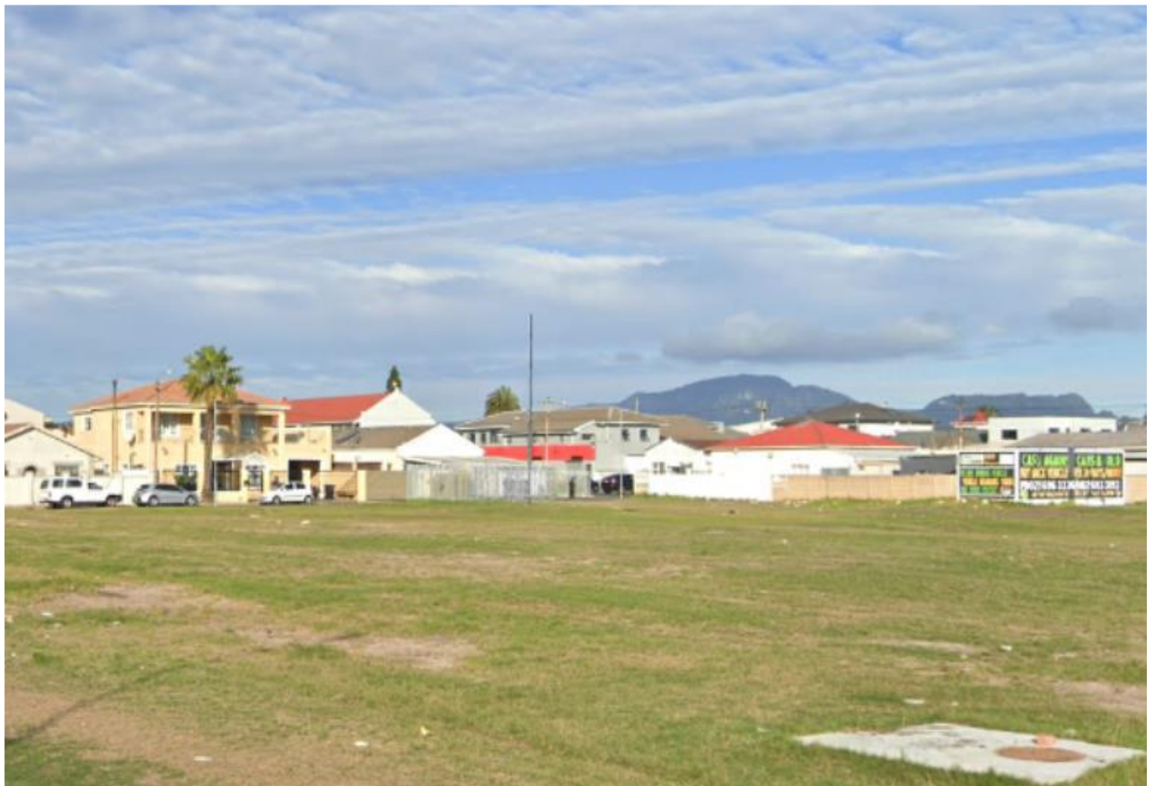
Superimposition of MFBS